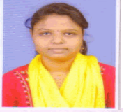
P.N. BanSode .